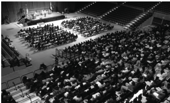
The opening Plenary Session at the University of California, Irvine Forum in April 2008