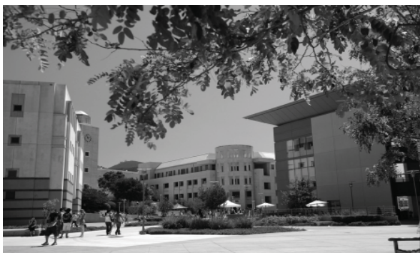
Library Plaza California State University, San Marcos

The California Forum for Diversity receives support from the CSU California Pre-Doctoral Program, the Chancellor's Doctoral Incentive Program, the University of California Office of the President, the campuses hosting or co-hosting the Forum, the National Science Foundation through the CSU Louis Stokes Alliance for Minority Participation Phase III Grant (HRD #0331537), and The Princeton Review.