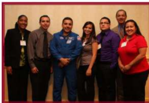
MESA Legacy — SDSU MESA students meet NASA astronaut & MESA alumnus Jose Hernandez.

Industry partners contribute to the development of a diverse MESA pipeline of future engineers and scientists. Learn more about becoming an Industry Advisory Board member and help the San Diego MESA Alliance to develop tomorrow's leaders.