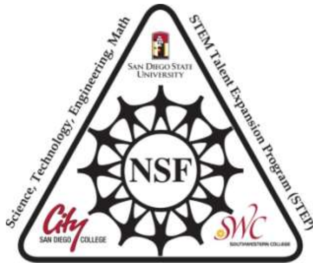
STEP Partnership of San Diego (SPSD)