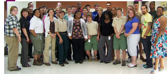
Student Career Experience Program Students at the Annual Orientation Session in Milwaukee, Wisconsin

Apply to the Forest Service, Eastern Region's Student Career Experience Program